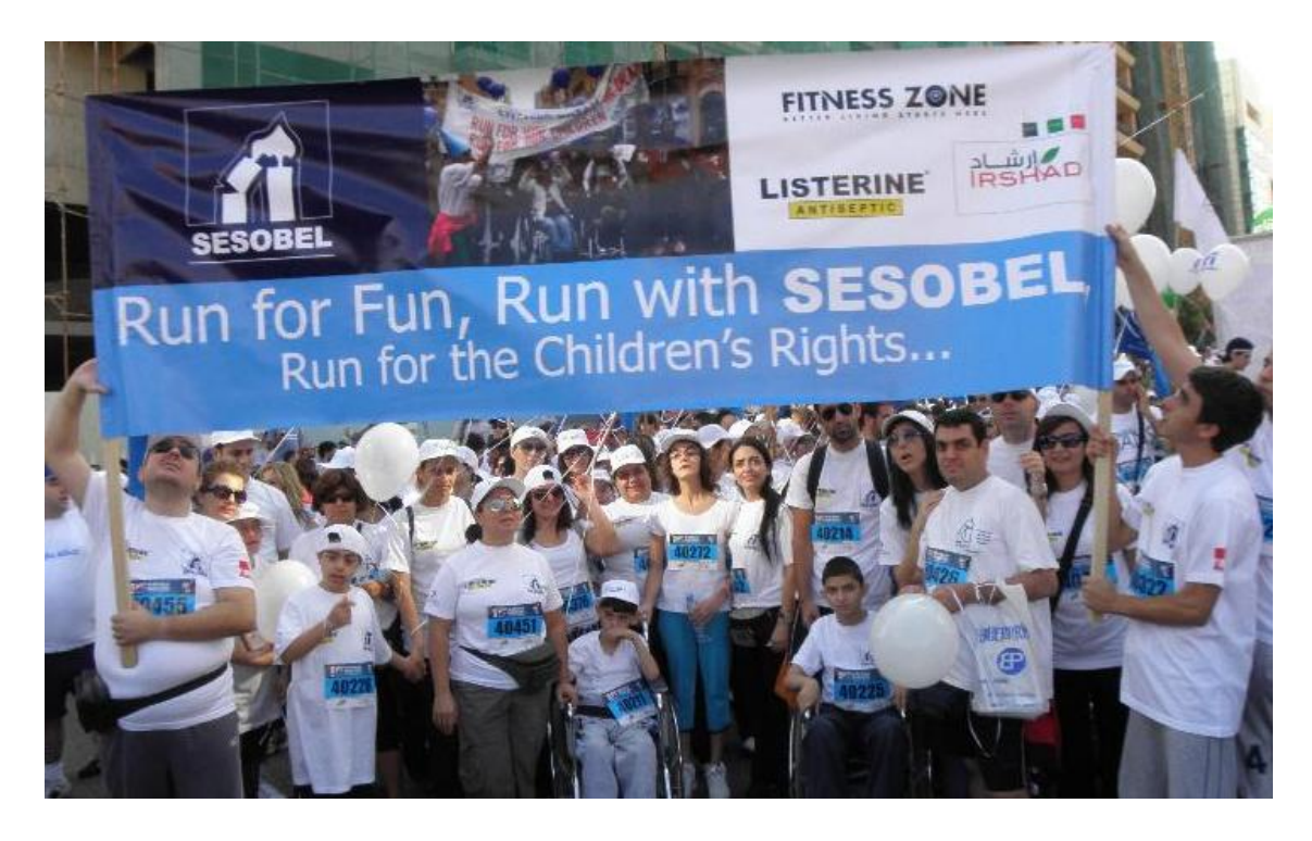
Members of SESOBEL, a disabled children's organisation in Lebanon, participate in the annual Beirut Marathon.

<u>GlobalDisabilityRightsNow.org</u> is managed by Mobility International USA (MIUSA) through the RightsNow!: Strong Communities through Enforcing the Rights of Persons with Disabilities project and in collaboration with the RightsNow! U.S. Consortium.