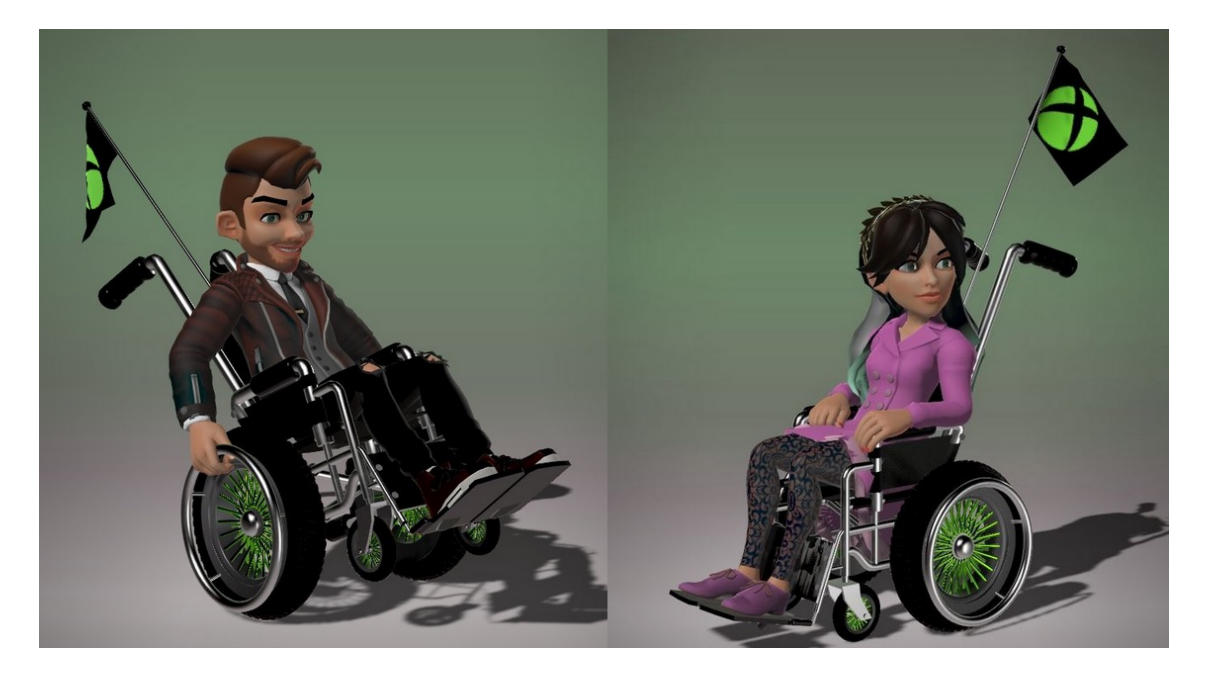
New Xbox wheelchair avatars, which should be available in the Xbox upgrade coming out this fall.

The parade will begin and end with rallies that will include entertainment and speakers. Vendors and informational kiosks will line the half-mile route, on which people of all disabilities are welcome to walk. Disability Pride, coincides with the 25th anniversary of the signing of the American's with Disability Act (ADA) in 1990 by President George HW Bush. So far, only Chicago and Philadelphia have sustained annual disability marches, with the first one taking place in Boston in 1990. To watch or join in, visit: www.disabilitypridenyc.org